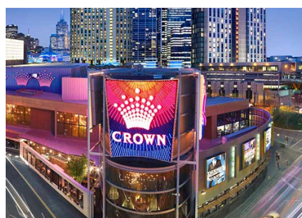
Melbourne Crown Casino

Winston Apartments is a 10-minute walk from Etihad Stadium and a 10-minute walk from Crown Casino Melbourne.