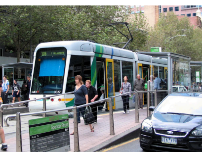
CBD free tram zone

Located on Collins Street in the heart of Melbourne CBD-Winston Apartments boasts an indoor pool, sauna, hot tub, and a fitness centre. All self-contained apartments offer free WiFi, cable channels, and city or ocean views.