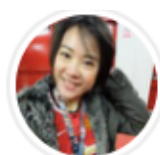
Wasana U Thailand Level 5 Contributor

45 reviews 15 hotel reviews 12 helpful votes