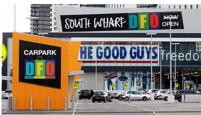
South Wharf DFO centre

Guests can relax in the spa and wellness centre, which is complete with a sauna room. Grocery delivery and housekeeping is available for your convenience.