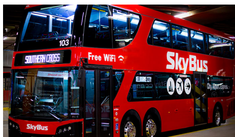
Airport shuttle - Skybus

Located on Collins Street in the heart of Melbourne CBD-Winston Apartments boasts an indoor pool, sauna, hot tub, and a fitness centre. All self-contained apartments offer free WiFi, cable channels, and city or ocean views.